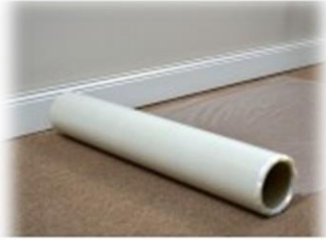
Carpet Protection Film

Used to protect polished and finely finished metals, plastics, laminates, glass, HVAC air ducts, natural polished stone and more.