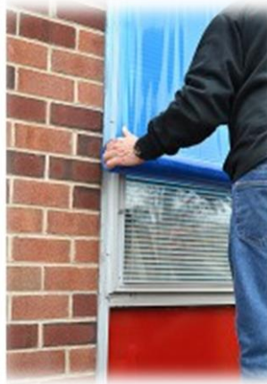
Window Protection Film