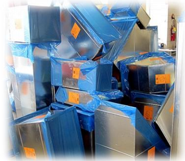
Duct Protection Film