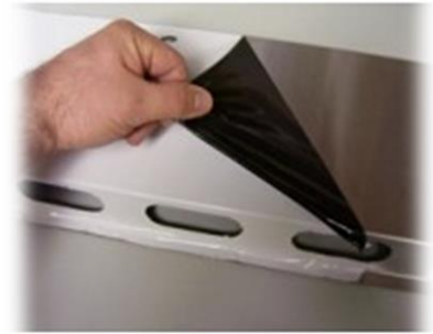
Metal Protection Film