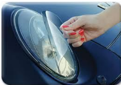
Other Surface Protection Film