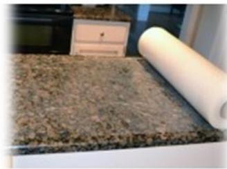
Counter Protection Film