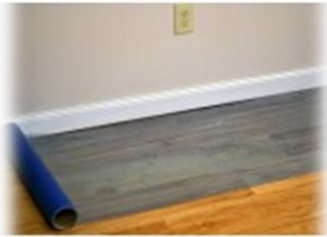
Floor Protection Film